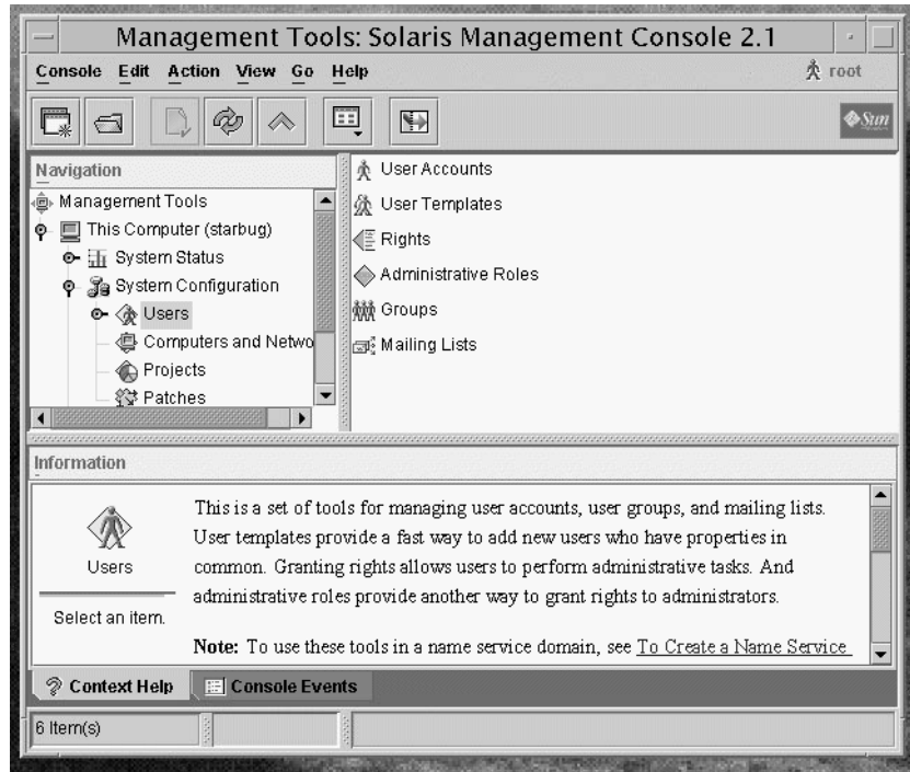
FIGURE 2-1 Solaris Management Console – Users Tool

The main part of the console consists of three panes: