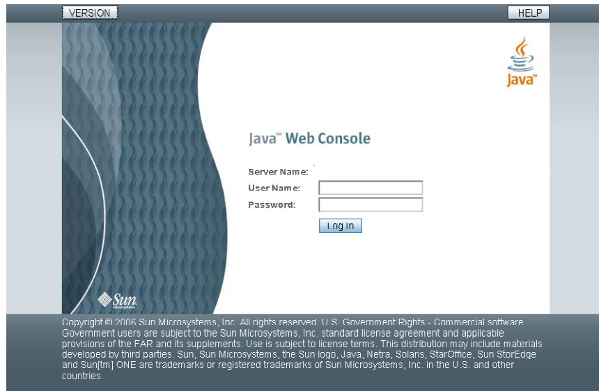
FIGURE 3–1 Java Web Console Login Page

After your user credentials are successfully authenticated, the launch page is displayed.